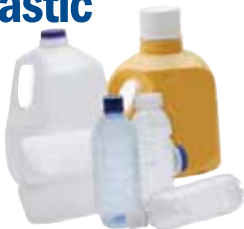
Plastic Jugs/Bottles/Household Plastic Empty containers only