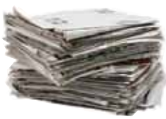
Newspaper Remove bags, strings & rubber bands