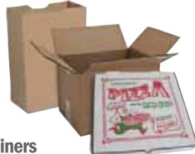
Cardboard, Pizza Boxes & Paper Bags Flatten cardboard & cut into pieces. Remove wax paper from pizza boxes